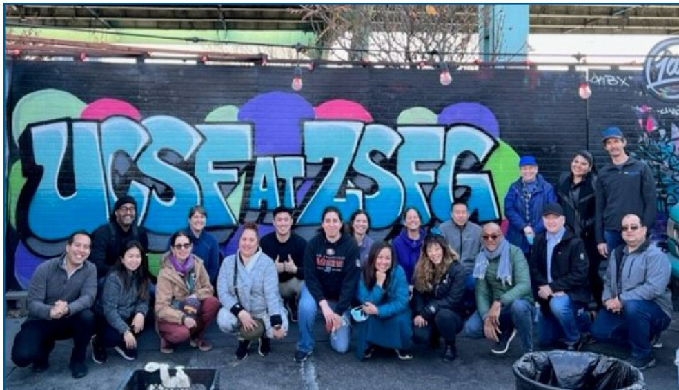
UCSF at ZSFG Vice Dean's Office staff gather together in a guided group graffiti mural creating event.

She is focusing much of her current efforts on the Zuckerberg Research and Academic Building (ZRAB), slated to open in May 2023. "It's a beautiful building which represents a new opportunity