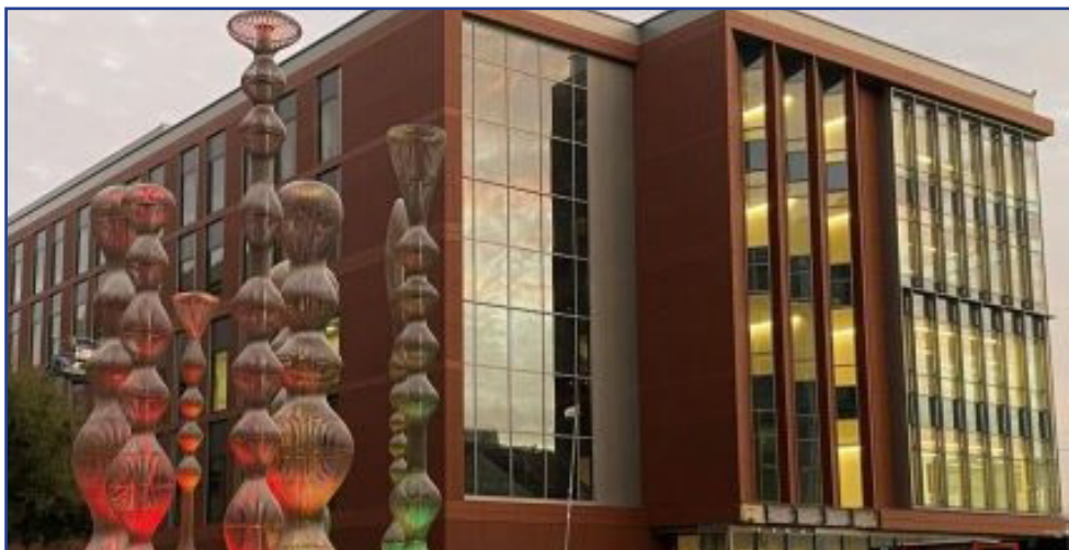
The UCSF Research and Academic Building at ZSFG (ZRAB) is nearing completion with move in scheduled for later this Spring.