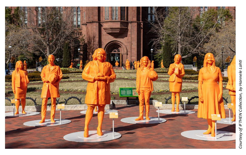
One-hundred twenty statutes showcase women in science, technology, engineering, and math (STEM) in the #IfThenSheCan - The Exhibit at the Smithsonian Institutionin Washington, DC. For more information about the exhibit and initiative: https://ifthenexhibit.org/